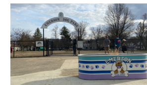
Emerson Dog Park is a great place to let your dog make friends!

Today's Village was once Normal City's commercial corridor and has a rich history of shops, restaurants, and entertainment venues.