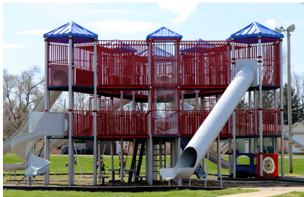
The image below shows Tuhey Park, which is a wonderful meeting space and a great location for families with young children.

The Village, a business district along University Avenue sits within the Riverside Normal City neighborhood and is just a few steps from Ball State's campus, includes casual dining, shops, and various other local businesses and is a popular hangout for neighborhood residents and students.