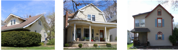
There are a variety of different architectural styles within Riverside Normal City, and all of them have their own charm and appeals.